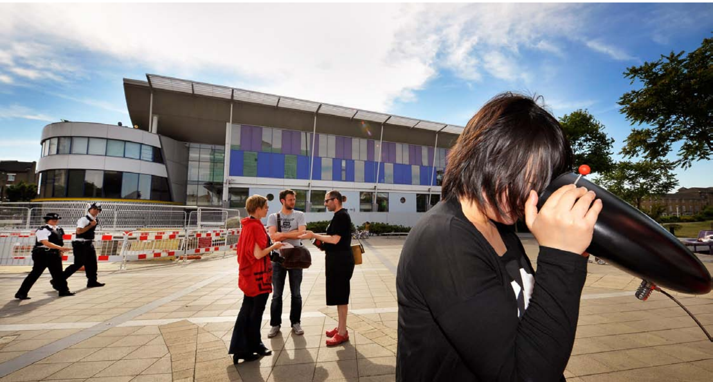
visitor/user at Peckham Space

Multiple layers of legislation 'hyper-regulate' today's open spaces. Some of these laws are outdated ( no sheep grazing in the park ), some bizarre ( hot air balloon take-offs permitted only in case of emergency ), some overzealous ( police to disperse groups of two or more persons in public places ), some simply unbelievable ( no tourist snapshots of bobbies allowed ).