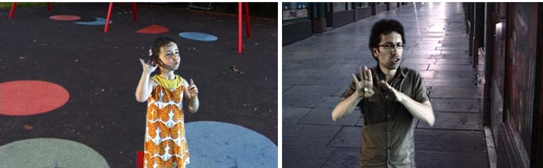
video stills Limitations Permitted

A series of short silent 3D videos quote extracts from specific local UK byelaws and laws that affect public space and our behaviour, interpreted into British Sign Language (BSL), which encodes meaning in three dimensions of space. BSL has its own history of repression through 'well-meaning experts'.